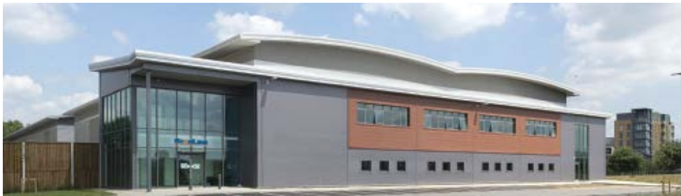
Starline’s UK-Based Manufacturing Facility

Another main factor that drove Fujitsu’s decision was its need to incorporate a flexible metering offering. It was important to the team that options for both wired and wireless metering, which could be directly integrated into the tap offs, were available. “Having a flexible metering option, where we could install wired or wireless meters was very useful,” adds Simon.